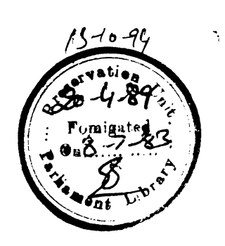
NEW DELHI GOVERNMENT OF INDIA PRESS 1937