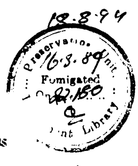
SIMLA GOVERNMENT CENTRAL-PRESS AGER